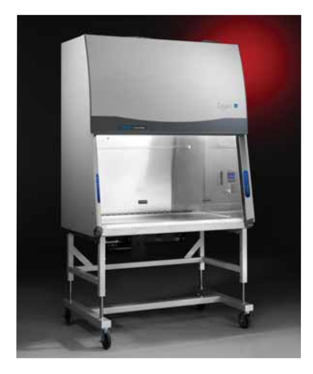
Labconco Corporation's Purifier<sup>®</sup> Logic<sup>™</sup> Biosafety Cabinet utilizes an ECM motor with a patent-pending process of delivering constant airflow.

Controlling the motor's operation with a microprocessor offers significant advantages. The ECM can measure and regulate its speed and power output (torque) without the use of external sensors or controllers — something a PSC motor could never do. The motor can also communicate its status to the equipment it is powering, offering instant feedback of the unit's performance. The ECM's microprocessor and memory allow the BSC manufacturer to develop and encode any number of programs controlling motor speed, power and even direction of rotation. The ultimate expression of the power of the ECM was the development of software and firmware by ECM manufacturer Regal-Beloit<sup>™</sup>, which allows the motor/blower to deliver a constant volume of air as the HEPA filters load, and their pressure drop increases.